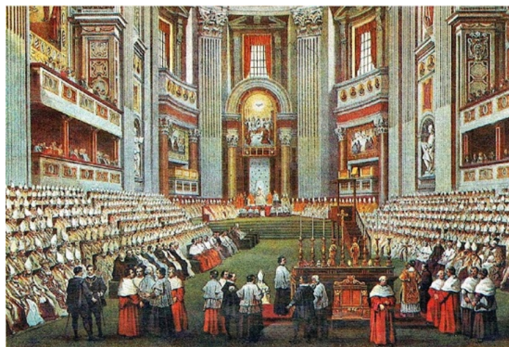
The Vatican Council 1870

The First Vatican Council, taught that "all those things are to be believed with divine and Catholic faith that are contained in the word of God, written or handed down, and which by the Church, either in solemn judgment or through her ordinary and universal teaching office, are proposed for belief as having been divinely revealed" (Dogmatic Constitution of 1870 Dei Filius ). This is perhaps the most comprehensive description of the Deposit of Faith. In short, it is the teaching of Christ given to the Apostles who were commanded to instruct the world to observe all that He commanded.