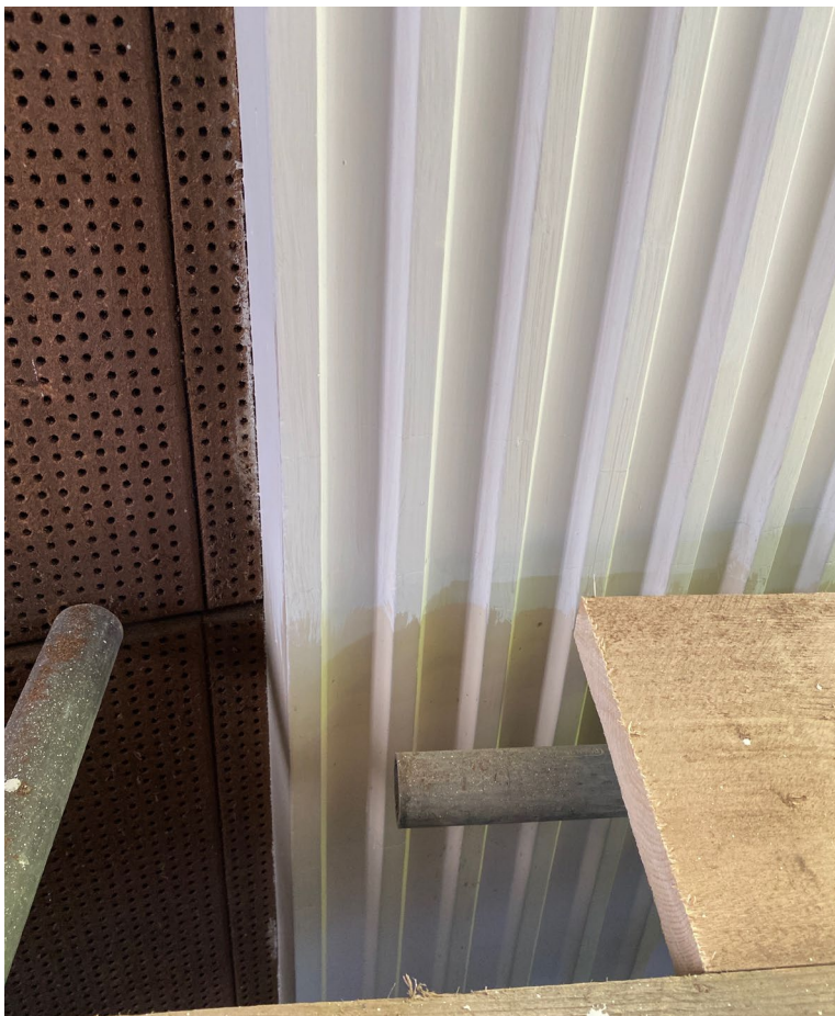
The old color of the pillars, compared with the new off-white color