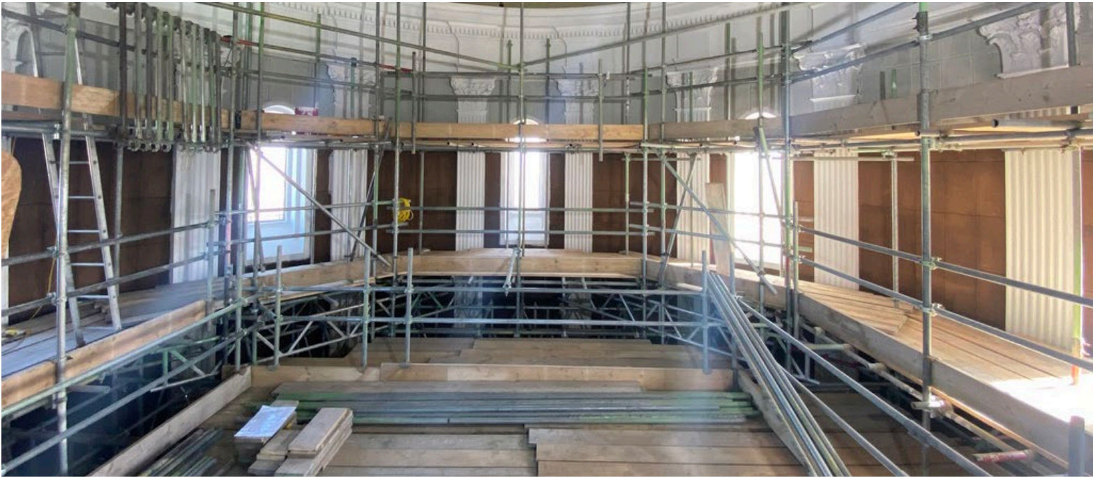
Inside of the dome: first overview of the off-white (pillars) and duck-egg blue (walls) colors