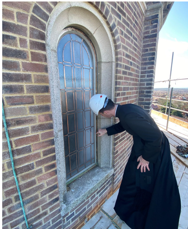
Inspection of the brand new restored glass-window, made with copper imported from Canada, to match the existing ones