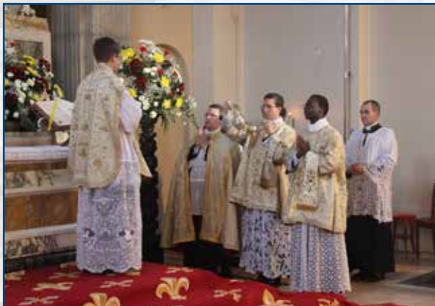
Incensation at the beginning of Mass.