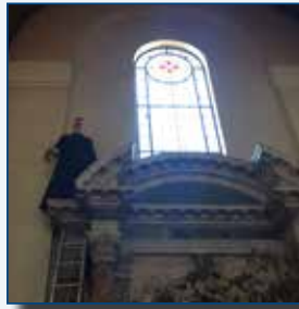
Abbé Vuylsteke, our seminarian, setting up the crib at the Altar of the Sacred Heart