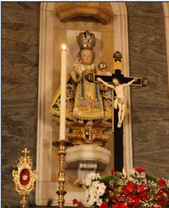
New statue of the Infant of Prague placed above the altar. If you would like us to light candle for your intentions, please contact us on 0151 638 6822 or newbrighton@icrsp.org

The Dome is supported by the Latin Mass Society