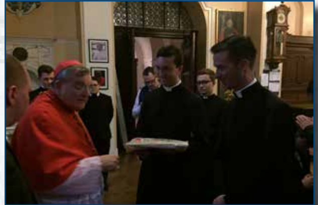
November: Canons Poucin (Preston) & Montjean (New Brighton) attended the LMS Annual Requiem Mass celebrated by His Eminence Cardinal Burke in Westminster Cathedral