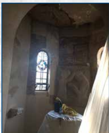
The restored baptistry

Below right: The façade with restored pointing and rose window