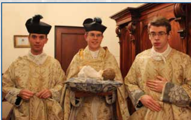
Christmas: Infant Jesus before being placed in the crib