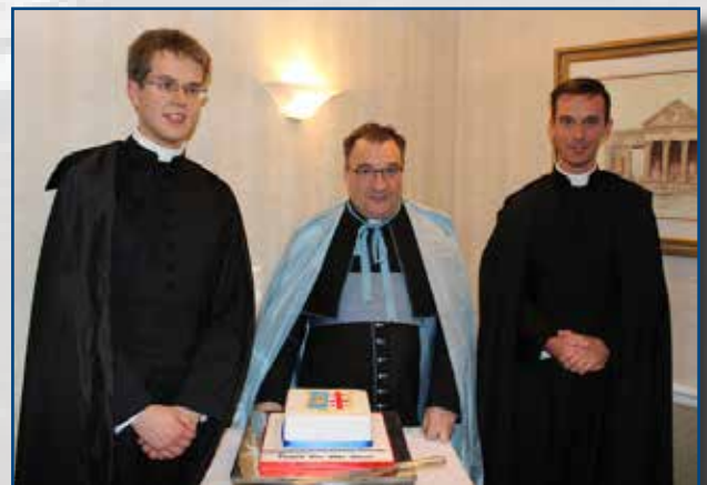
The beautiful cake made for the reception that followed