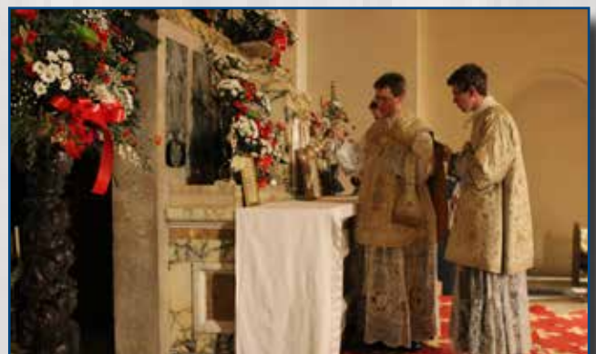
Christmas: Incensation of the altar during Solemn High Mass of Midnight