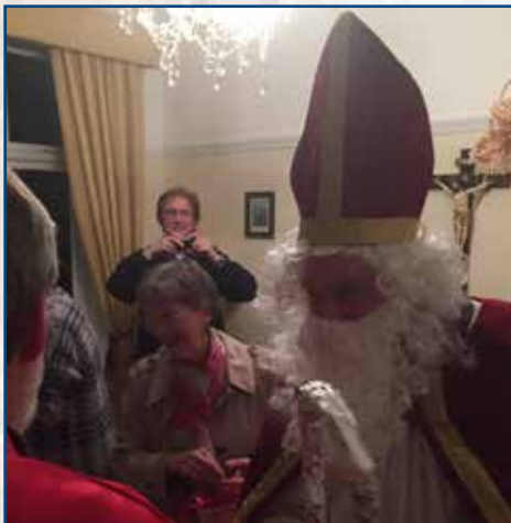
December: Ho ho ho! Saint Nicholas visits the Dome bringing his traditional gifts