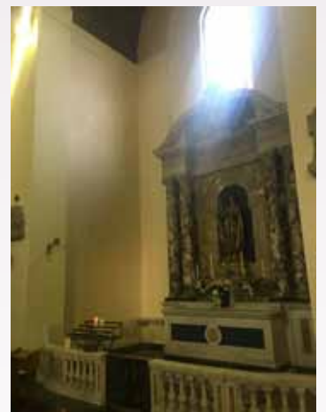
7 th February: Canon Montjean making the final project inspection ( left ). The result, outside and inside ( middle & right ).