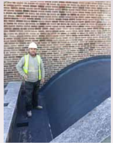
Arrival of the scaffolding ( left ) and the Church covered with it ( middle ). A newly repaired roof with the repointed wall behind, and the man responsible for the work ( right ).