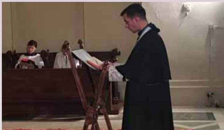
Gregorian office of Matins ( right ), Solemn High Mass of Midnight ( left ), a new outdoor wooden crib ( bottom left ): The Lord is born at the Dome. 11 th -13 th February: 40 Hours devotion, all-day Adoration in reparation of the offenses to the Lord in the Blessed Sacrament ( bottom right ).