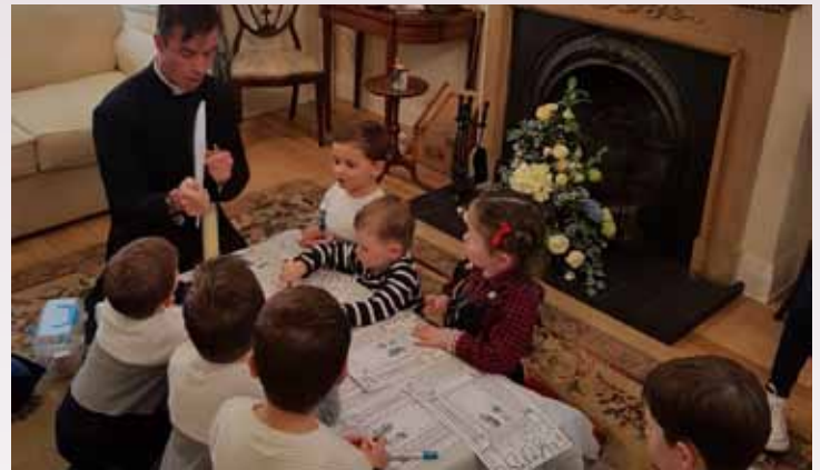
Since October, each 1 st Saturday, we welcomed families with parents and children together for a recollection day, centered on the Apparitions of Our Lady in Fatima. Mass, talks for the children & parents, craft activities, procession and rosary: here are some photos of these enjoyable family moments.