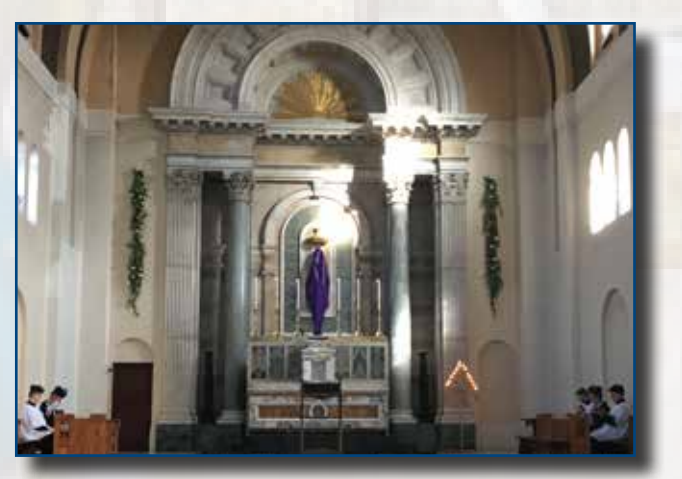
Good Friday Office of Tenebrae