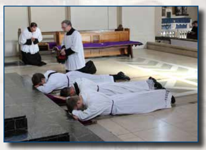
Good Friday Prostration

Dom Gueranger's LiturgicalYear: Mystery of HolyWeek