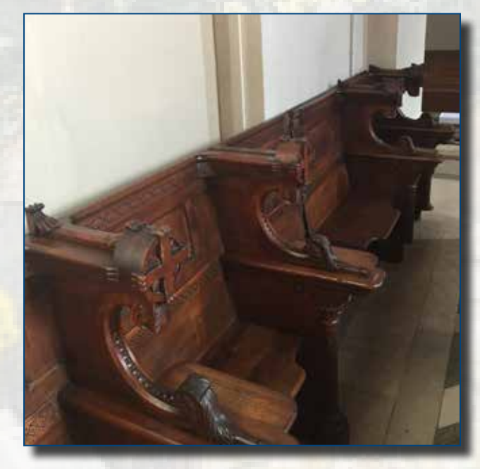
Our generously-donated new choir stalls.