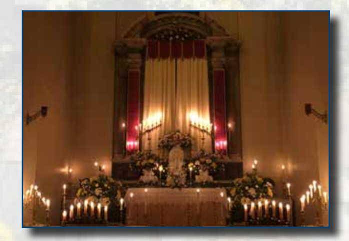
Maundy Thursday Altar of Repose

The presentiment of that awful hour leads the afflicted mother to veil the image of her Jesus: the cross is hidden from the eyes of the faithful. The statues of the saints, too, are covered; for it is but just that, if the glory of the Master be eclipsed, the servant should not appear. The interpreters of the liturgy tell us that this ceremony of veiling the crucifix during Passiontide, expresses the humiliation to which our Saviour subjected Himself.