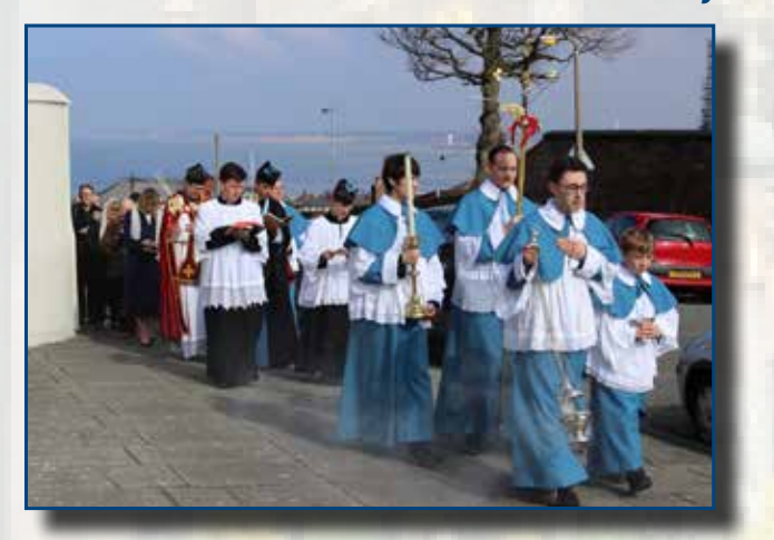
Palm Sunday Procession overlooking the sea