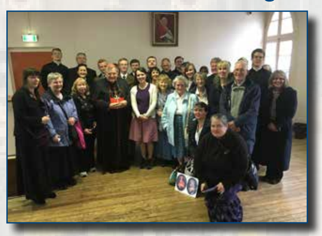
Cardinal Burke gave a Conference on Mercy to our English Pilgrims