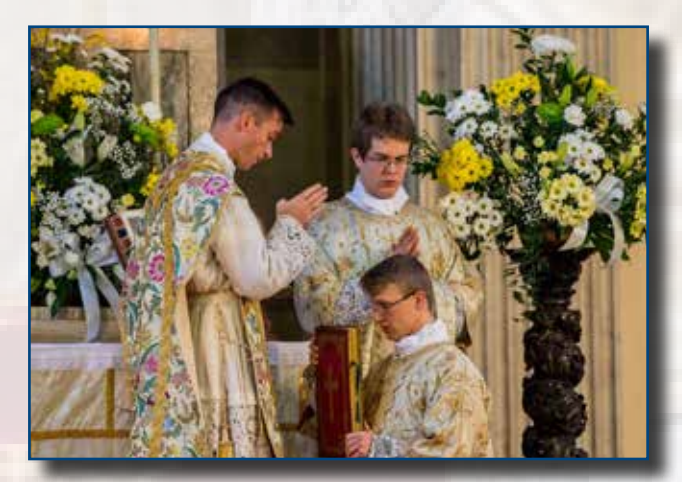
Easter Sunday: Blessing of the Subdeacon after the Epistle at Solemn High Mass