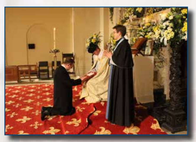
Holy Saturday: Reception into Full Communion