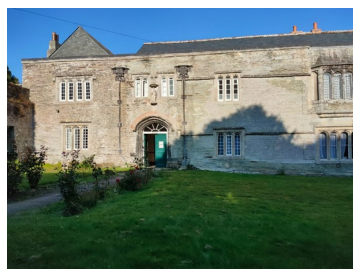
The façade of Lanherne Convent

8 bottles are available from Ronnie and Maureen in the Piety shop / Suggested donation of £10