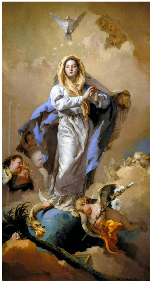
Thursday the 8<sup>th</sup> December 2022.

According to the Catechism of the Catholic Church: