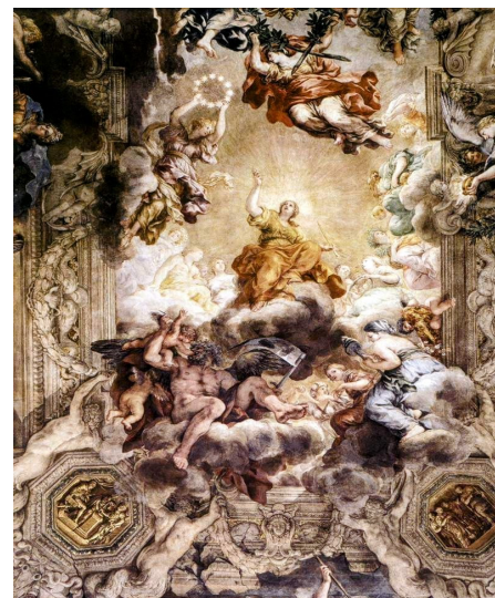
(Allegory of Divine Providence. 1633-39. Pietro da Cortona. Fresco. Gran Salone, Palazzo Barberini, Rome.)