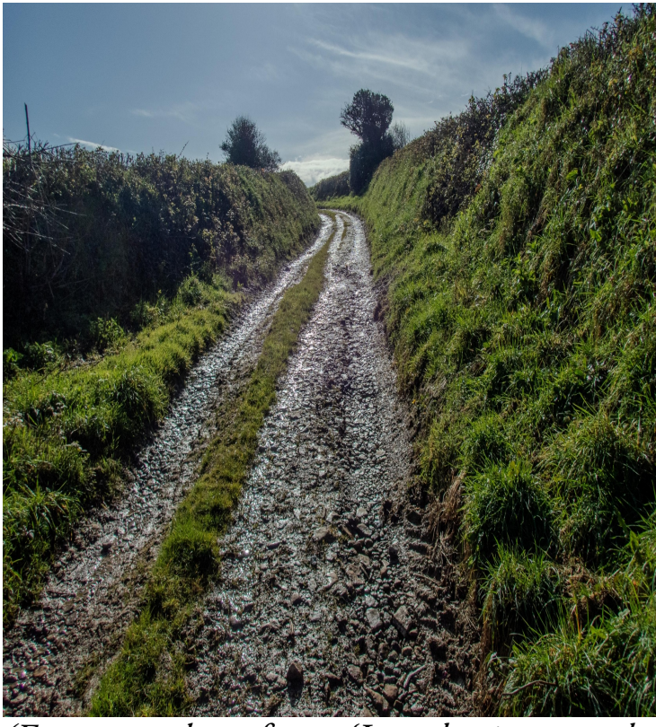
(Extracts taken from 'Introduction to the Devout Life' by St. Francis de Sales)

For just as bees, surprised by a storm in the fields, take up little pieces of gravel so that they may be able to balance themselves in the air and not be so easily carried away by the wind, so also our soul, having a strong resolution firmly embraced the precious love of God, continues constant in the midst of the inconstancy and vicissitudes of consolation and afflictions, whether spiritual or temporal, exterior or interior.