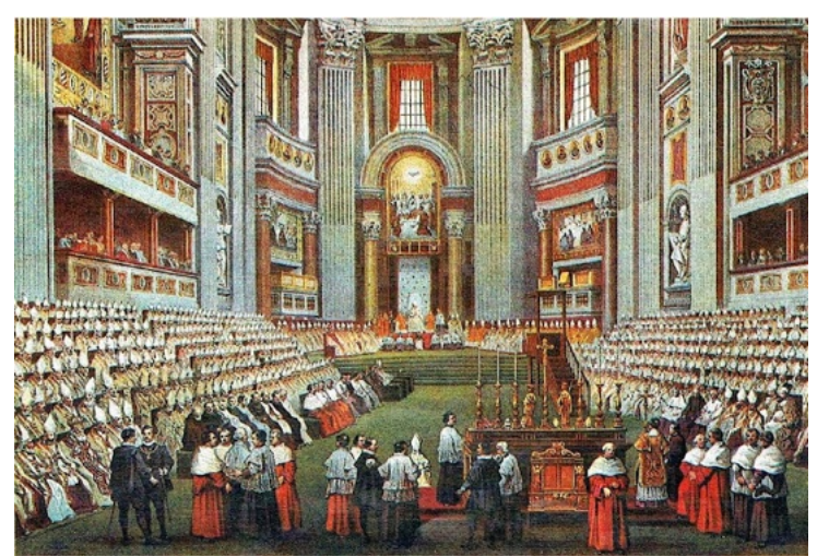
The Vatican Council 1870

The First Vatican Council, taught that "all those things are to be believed with divine and Catholic faith that are contained in the word of God, written or handed down, and which by the Church, either in solemn judgment or through her ordinary and universal teaching office, are proposed for belief as having been divinely revealed" (Dogmatic Constitution of 1870 Dei perhaps the Filius). This is most comprehensive description of the Deposit of Faith. In short, it is the teaching of Christ given to the Apostles who were commanded to instruct the world to observe all that He commanded.