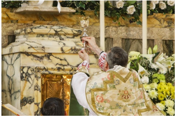
He is not cut by the receiver, nor broken, nor divided; He is taken whole.

The Flesh is food, the Blood is drink; yet Christ is whole under each species.