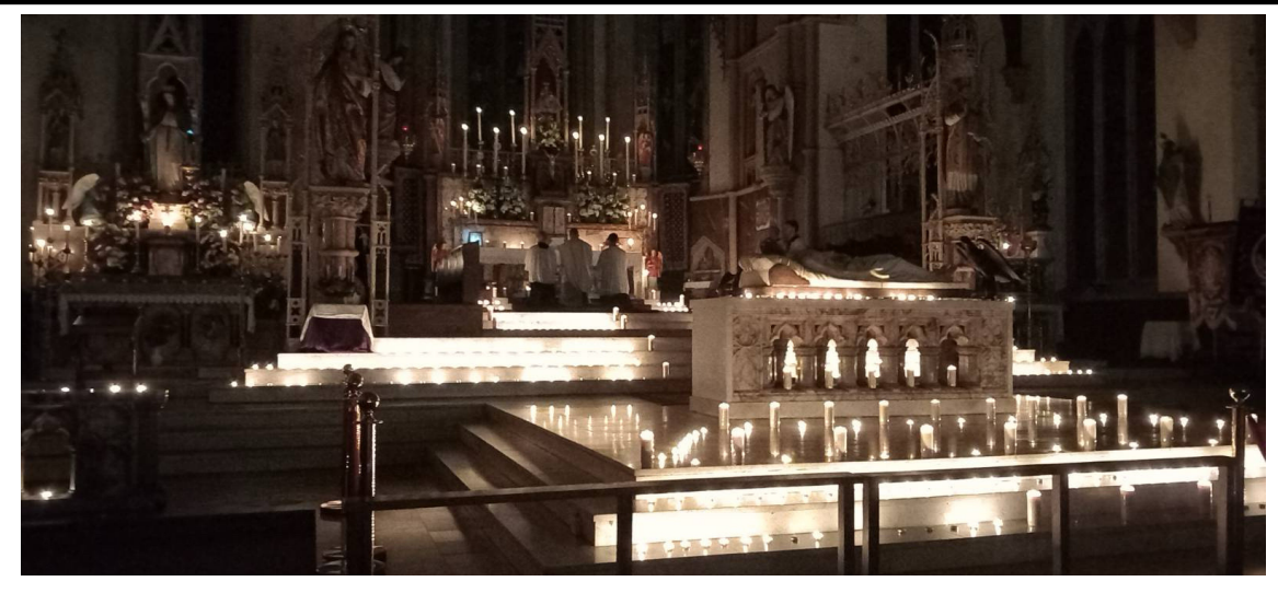
Rorate Mass yesterday

News & updates from our Shrine Churches for our community in Preston, Lancashire, England.