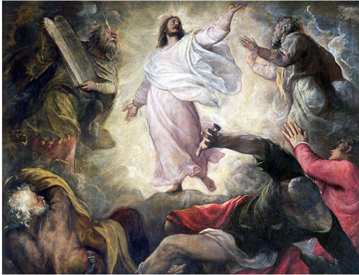
The Holy Transfiguration of Our Lord

News & updates from our Shrine Churches for our community in Preston, Lancashire, England.