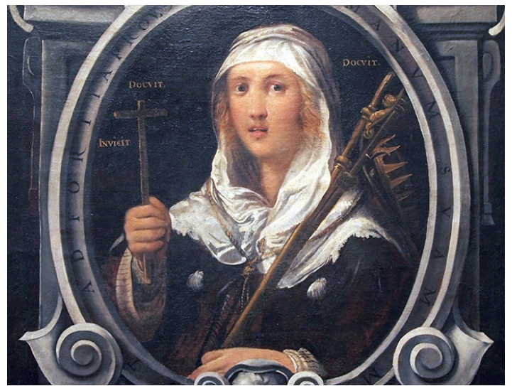
Saint Walburga: Virgin & Abbess