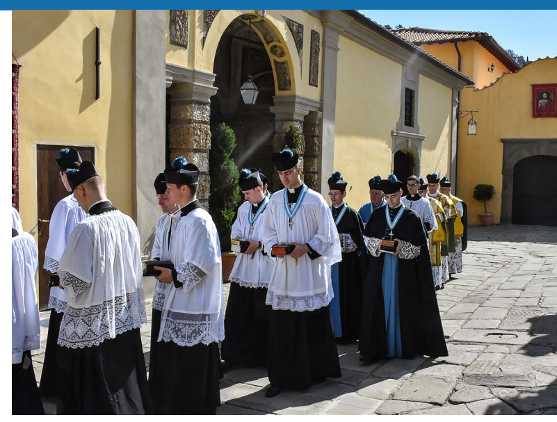
Canons and seminarians enter the chapel in Gricigliano.

There is a charity put in place in the UK to support the work of the Institute. By signing up to the Gift Aid