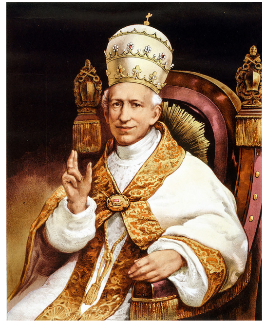
Pope Leo XIII

Sacred Heart of Jesus, by Pompeo Batoni, 1767, Rome, Church of the Gesù.