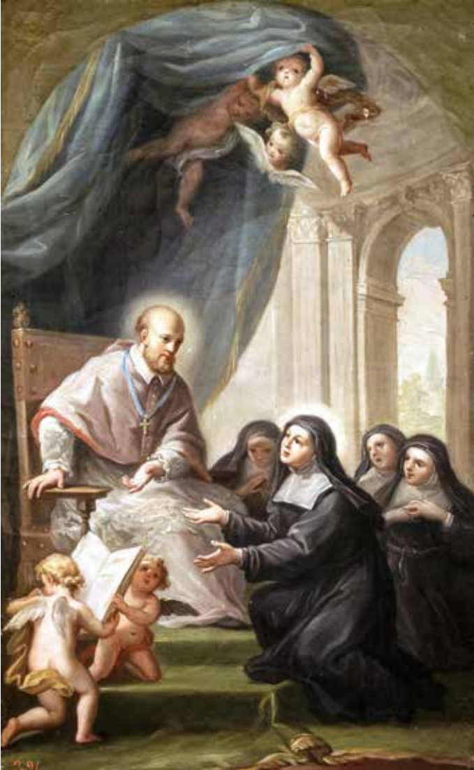
Saint Francis de Sales, by Francisco Bayeu y Subias, collection of Museo del Prado, now at Museo de Salamanca, Spain

“... it appears that Francis de Sales was given to the Church by God for a very special mission. His task was to give the lie to a prejudice which in his lifetime was deeply rooted and has not been destroyed even today, that the ideal of genuine sanctity held up for our imitation by the Church is impossible of attainment or, at best, is so difficult that it surpasses the capabilities of the great majority of the faithful ...” [4]