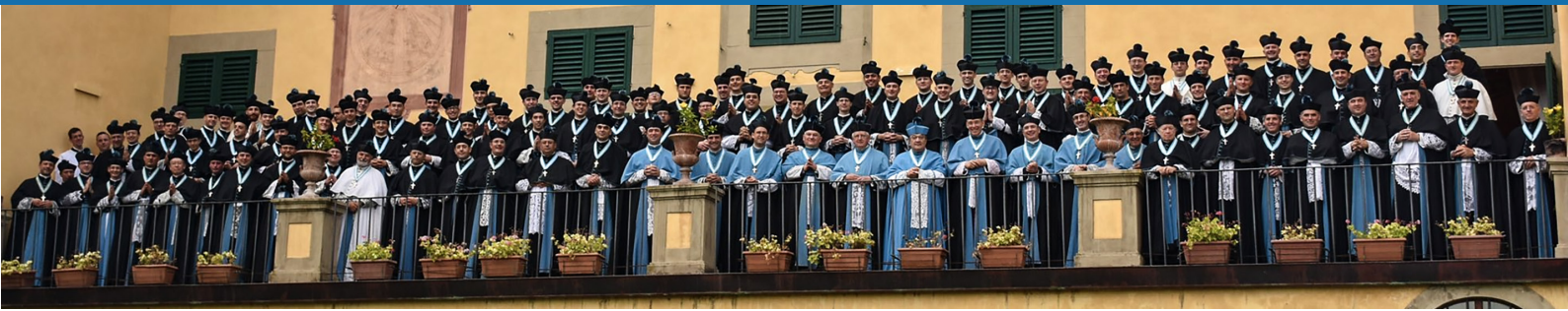
Institute of Christ the King GENERAL CHAPTER 2021