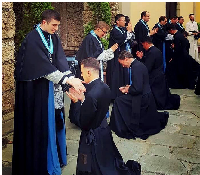
Priests ordained in July give first blessings to their bretheren who were unable to travel for the Ordination ceremonies

✦ Please continue to pray for the superiors of the Institute and all canons who attended this year's Chapter.