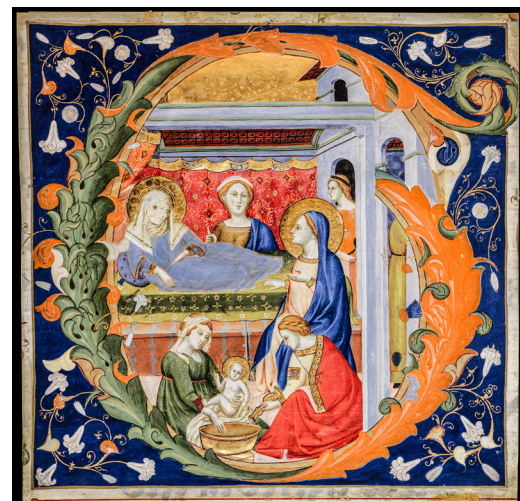
Manuscript Illumination with the Birth of the Virgin, from a Gradual of Santa Maria degli Angeli ca. 1375, by Don Silvestro de’ Gherarducci Italia, Made in Florence, Metropolitan Museum of Art, New York City

Our weak human nature, subject to time, can conceive of things only according to the series of their progressive evolutions; but God sees them independently of time, which He rules with His eternity; He sees them in the order of mutual dependence in which He has placed them with a view to the manifestation of His glory. With God, the beginning and the principle of every work is the purpose for which it is done. Now the Most High acts outside Himself solely to reveal Himself, by His Word made Flesh and become the Son of a created Mother as He is the Son of the Creator. The God-Man as end, Mary as the means: such is the object of the eternal decrees, the purpose of the world’s existence, the fundamental conception, with regard to which all else is but accessory and dependent.