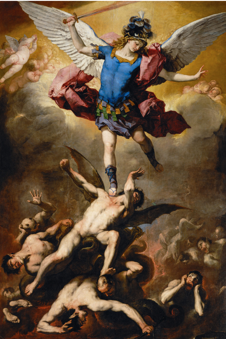
The Fall of the Rebel Angels, Luca Giordano, 1660-1665, Kunsthistorisches Museum, Vienna

Let us not be envious. By nature the angel is superior to us; but, to which of the angels hath He said at any time, “Thou art My Son?” (Hebrews 1:5, Psalm 2:7) The only-begotten Son of God did not take to Himself the angelic nature. When on earth, He acknowledged the temporary subordination of humanity to those pure spirits, and deigned to receive from them, even as do His brethren in the flesh, and announcements of the divine will, and help and strength. (Luke 22:43) But “God hath not subjected unto angels the world to come,” says the apostle. (Hebrews 2:5) How can we understand this attraction of God towards what is feeblest? We can only worship it in humble, loving faith. It was Lucifer’s stumbling-block on the day of the great battle in heaven. But the faithful angels prostrated themselves in joyous adoration at the feet of the Infant-God foreshown to them enthroned on Mary’s knee, and then rose up to sing: “Glory to God in the highest, and on earth peace to men of good will.”