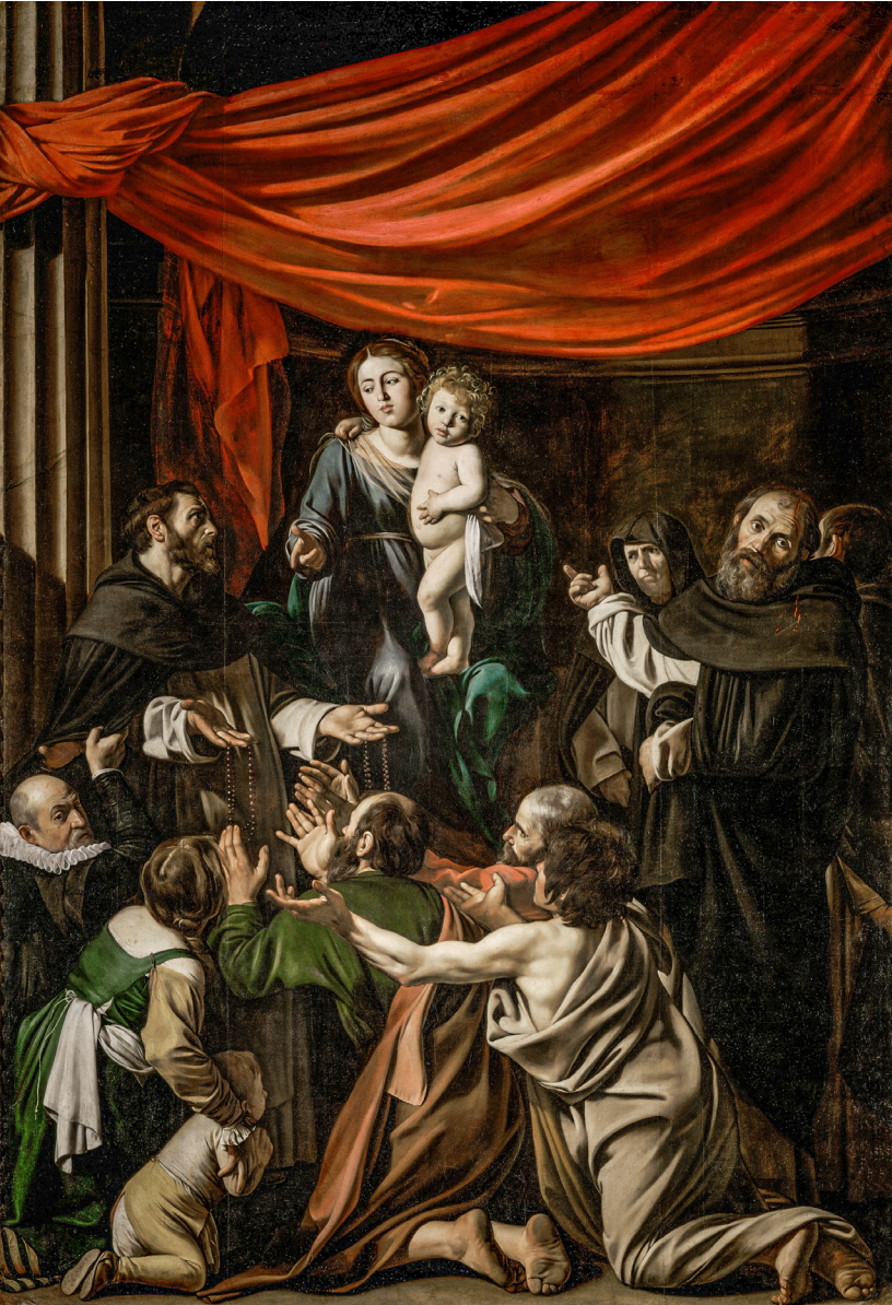
Madonna of the Rosary, Caravaggio, 1605-1607, Kunsthistorisches Museum, Vienna

But since the salvation of our race was accomplished by the mystery of the Cross, and since the Church, dispenser of that salvation after the triumph of Christ, was founded upon earth and instituted, Providence established a new order for a new people. The consideration of the Divine counsels is united to the great sentiment of religion. The Eternal Son of God, about to take upon Him our nature for the saving and ennobling of man, and about to consummate thus a mystical union between Himself and all mankind, did not accomplish His design without adding there the free consent of the elect Mother, who represented in some sort all human kind, according to the illustrious and just opinion of St. Thomas, who says that the Annunciation was effected with the consent of the Virgin standing in the place of humanity. With equal truth may it be also affirmed that, by the will of God, Mary is the intermediary through whom is distributed unto us this immense treasure of mercies gathered by God, for mercy and