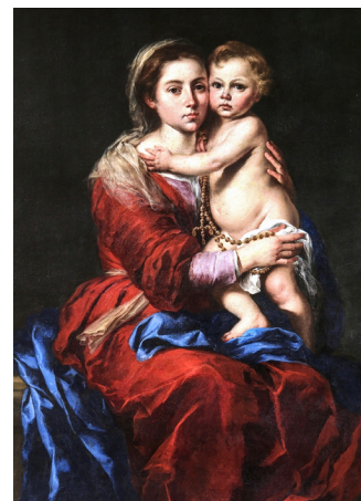
Virgin and Child with a Rosary, Bartolomé Esteban Murillo, 1650-1655, Museo del Prado, Madrid

Now, among the several rites and manners of paying honor to the Blessed Mary, some are to be preferred, inasmuch as we know them to be most powerful and most pleasing to our Mother; and for this reason we specially mention by name and recommend the Rosary. The common language has given the name of corona to this manner of prayer, which recalls to our minds the great mysteries of Jesus and Mary united in joys, sorrows, and triumphs. The contemplation of these august mysteries, contemplated in their order, affords to faithful souls a wonderful confirmation of faith, protection against the disease of error, and increase of the strength of the soul. The soul and memory of him who thus prays, enlightened by faith, are drawn towards these mysteries by the sweetest devotion, are absorbed therein and are surprised before the work of the Redemption of mankind, achieved at such a price and by events so great. The soul is filled with gratitude and love before these proofs of Divine love; its hope becomes enlarged and its desire is increased for those things which Christ has prepared for such as have united themselves to Him in imitation of His example and in participation in His sufferings. The prayer is composed of words proceeding from God Himself, from the Archangel Gabriel, and from the Church; full of praise and of high desires; and it is renewed and continued in an order at once fixed and various; its fruits are ever new and sweet.