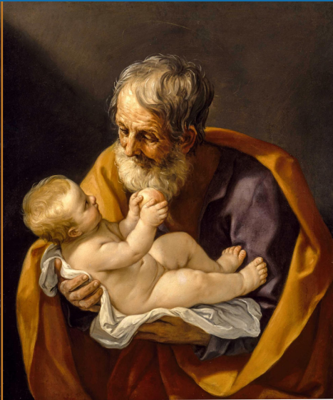
Saint Joseph, Guido Reni, 1640, Museum of Fine Arts, Houston