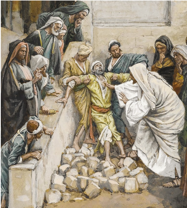
The Blind and Mute Man Possessed by Devils (detail), James Tissot, between 1886 and 1894, Brooklyn Museum, USA