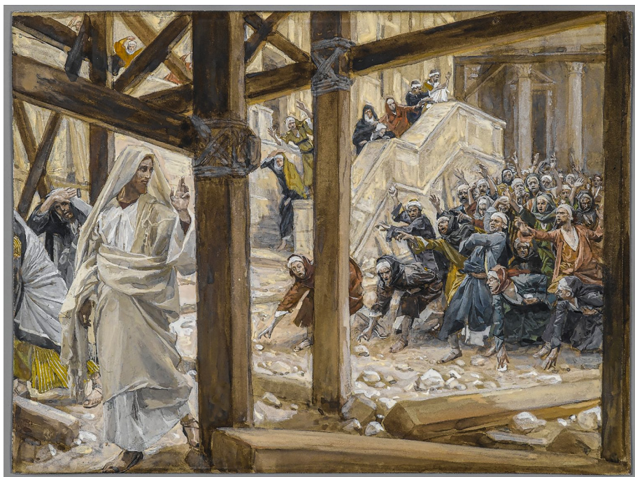
The Jews Took Up Rocks to Stone Jesus, by James Tissot, from the portfolio/series La Vie de Notre-Seigneur Jésus-Christ, 1886-98, Brooklyn Museum