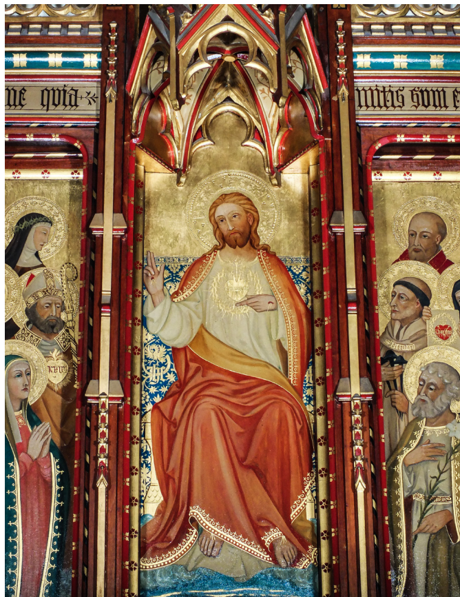
Sacred Heart Chapel, Shrewsbury Cathedral