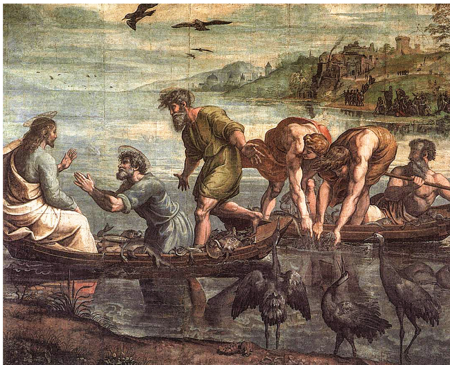
The Miraculous Draught of Fishes, Raphael, 1515, Royal Collection, Victoria and Albert Museum, London

At that time, when the multitude pressed upon Jesus to hear the word of God, He stood by the lake of Gennesareth. And He saw two ships standing by the lake; but the fishermen were gone out of them, and were washing their nets; and going up into one of the ships that was Simon's, he desired him to draw back a little from the land: and sitting He taught the multitudes out of the ship. Now when He had ceased to speak, he said to Simon: Launch out into the deep, and let down your nets for a draught. And Simon, answering, said to Him: Master, we have labored all the night, and have taken nothing, but at Thy word I will let down the net. And when they had done this, they enclosed a very great multitude of