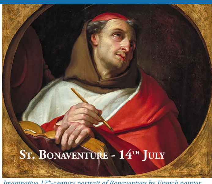
Imaginative 17^{th} -century portrait of Bonaventure by French painter and friar Claude François, circa 1655, National Gallery of Canada

May God reward you for all your help and material support, especially for your prayers on behalf of this apostolate of the Institute of Christ the King Sovereign Priest in Shrewsbury.