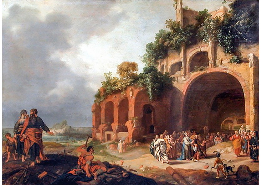
ABOVE: Jesus Healing a Deaf-mute , Bartholomeus Breenbergh, 1635, Louvre Museum, Paris

In God hath my heart confided, and I have been helped; and my flesh hath flourished again; and with my will I will give praise to Him. Unto Thee have I cried, O Lord: O my God, be not Thou silent: depart not from me. Alleluia, alleluia. (Ps. 80:2, 3.) Rejoice in God our helper: sing aloud to the God of Jacob, take a pleasant psalm with the harp. Alleluia.