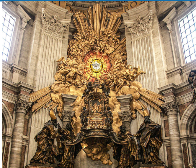
St. Peter's Chair at St. Peter's Basilica, Rome. Relic encased in sculpture by Gian Lorenzo Bernini, 1666