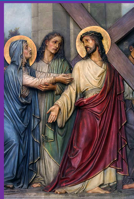
LEFT: 3rd Station - Jesus falls for the first time RIGHT: 4th Station - Jesus meets His Sorrowful Mother

Stations of the Cross with veneration of the relic of the Holy Cross each Friday in Lent at 9:00 am, before the 10:00 am Mass.