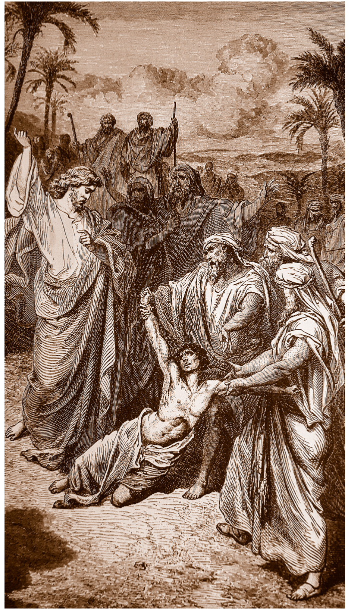
Casting out demons, Gustave Dore Bible illustration, c1870