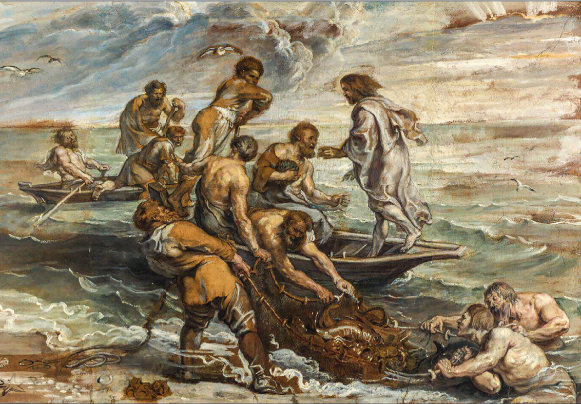
The Miraculous Draught of Fishes, Peter Paul Rubens, 1618-19, National Gallery, London.