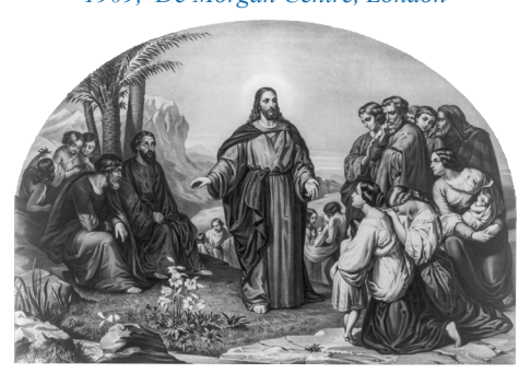
Christ's sermon on the mount: The parable of the lily, 1866, Currier & Ives