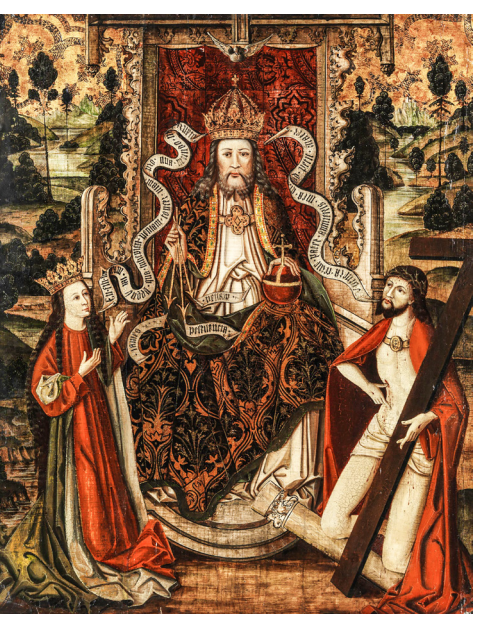
Seek ye therefore first the Kingdom of God: Anonymous painter from Westphalia, late 15th century, God the Father on a throne, with Virgin Mary and Jesus