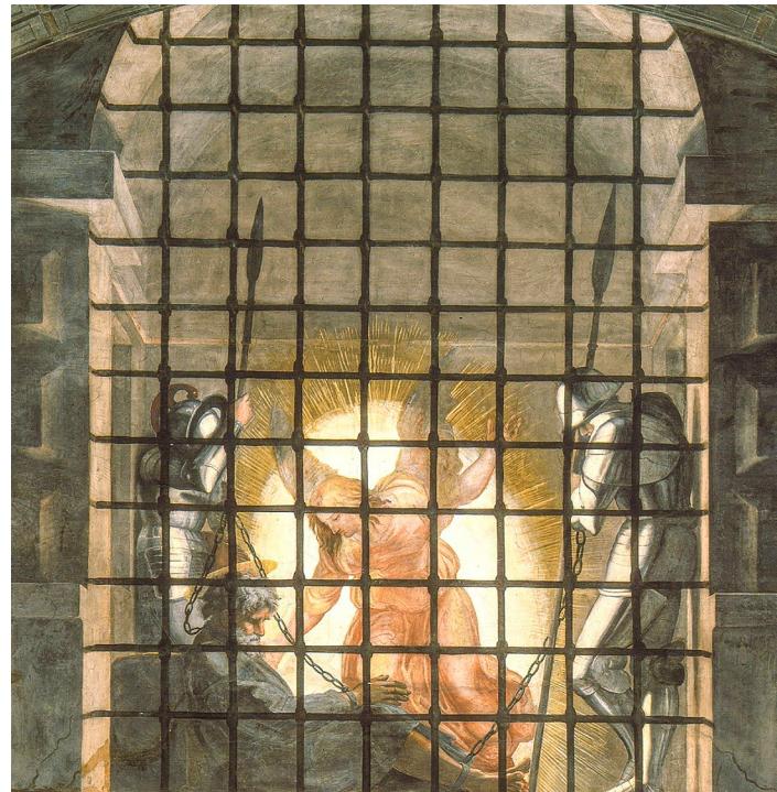
ABOVE: From today's Epistle: Deliverance of Saint Peter , Raphael, 1514, part of Stanza di Eliodoro , Raphael Rooms, Apostolic Palace, Vatican City

Be appeased, O Lord, by our supplications, and graciously accept these offerings of Thy people: neither suffering the hope of anyone to be in vain, nor his prayer to remain unheard, that we may obtain that for which we faithfully pray. Through our Lord