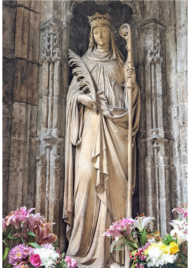
Statue of Saint Winefride at Saint Winefride's Well at Holywell.

At that time, Jesus spoke to His disciples this parable: The kingdom of Heaven shall be like to ten virgins, who taking their lamps went out to meet the bridegroom and the bride. And five of them were foolish, and five wise; but the five foolish having taken their lamps, did not take oil with them: but the wise took oil in their vessels with the lamps. And the bridegroom tarrying, they all slumbered and slept. And at midnight there was a cry made: Behold the bridegroom cometh, go ye forth to meet him. Then all those virgins arose and trimmed their lamps. And the foolish said to the wise: Give us of your oil, for our lamps are gone out. The wise answered, saying: Lest perhaps there be not enough for us and for you, go ye rather to them that sell, and buy for yourselves. Now, whilst they went to buy, the bridegroom came: and they that were ready went in with him to the marriage, and the door was shut. But at last came also the other virgins, saying: Lord, Lord, open to us. But he answering said: Amen I say to you, I know you not. Watch ye therefore, because you know not the day nor the hour.