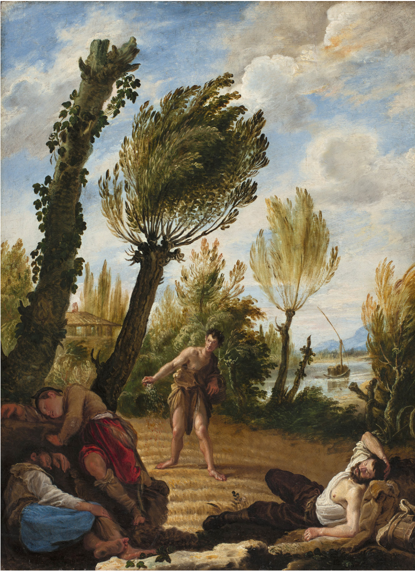
The Parable of the Weeds, Domenico Fetti, circa 1622, Museo Nacional Thyssen-Bornemisza, Madrid