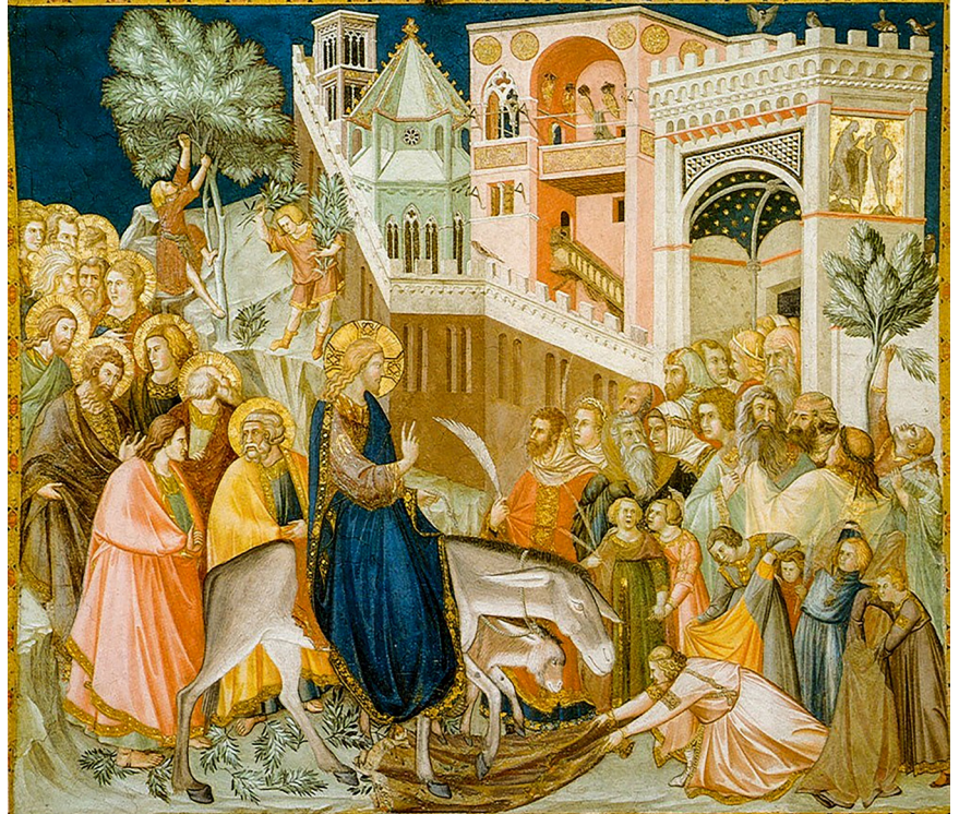
ABOVE: Christ's entry into Jerusalem, Pietro Lorenzetti, 1320, Basilica of San Francesco d'Assisi, Assisi, Italy

O God, my God, look upon me; why hast Thou forsaken me? V : Far from my salvation are the words of my sins. V : O my God, I shall cry by day, and Thou wilt not hear; and by night, and it shall not be reputed as folly in me. V : But Thou dwellest in the holy place, the praise of Israel. V : In Thee have our fathers hoped; they have hoped, and Thou hast delivered them. V : They cried to Thee, and they were saved; they trusted in Thee, and were not confounded. V : But I am a worm, and no man: the reproach of men and the outcast of the people. V : All they that saw Me have laughed Me to scorn; they have spoken with the lips and wagged the head. V : He hoped in the Lord, let Him deliver Him; let Him save Him, seeing He delighteth in Him. V : But they have looked and stared upon Me; they parted My garments amongst them, and upon My vesture they cast lots. V : Deliver me from the lion's mouth, and my lowness from the horns of the unicorns. V : Ye that fear the Lord, praise Him; all ye the seed of Jacob, glorify Him. V : There shall be declared to the