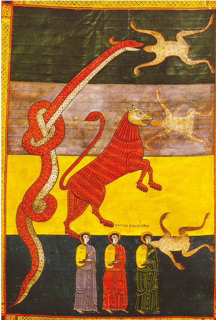
The mouth of the False Prophet. Apoc. XVI, by Facundus, for Ferdinand I of Castile and León and Queen Sancha, 1047, French illumination, Biblioteca Nacional, Madrid