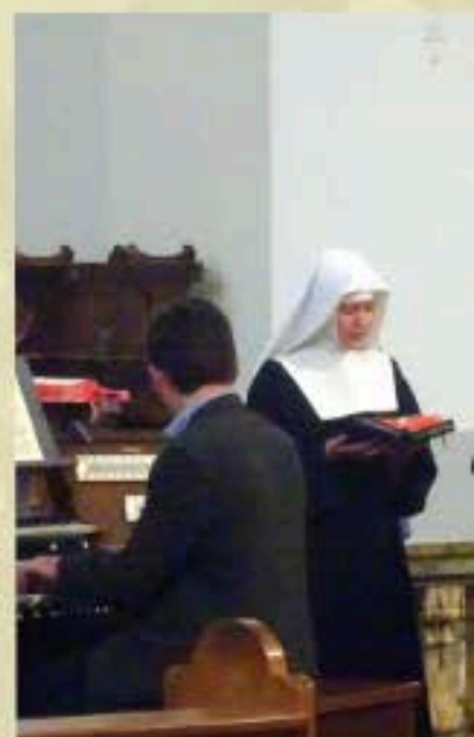
Organ and Gregorian Ss. Peter & Paul a Shrine Church, i

The processions of the month of Mary and of the Feast of the English Martyrs enabled us to show the city our attachment to these devotions which are so important and filled with many graces.