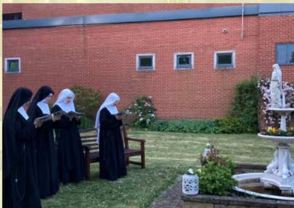
Ora et Labora: gardening and devotions to Our Lady during the month of May