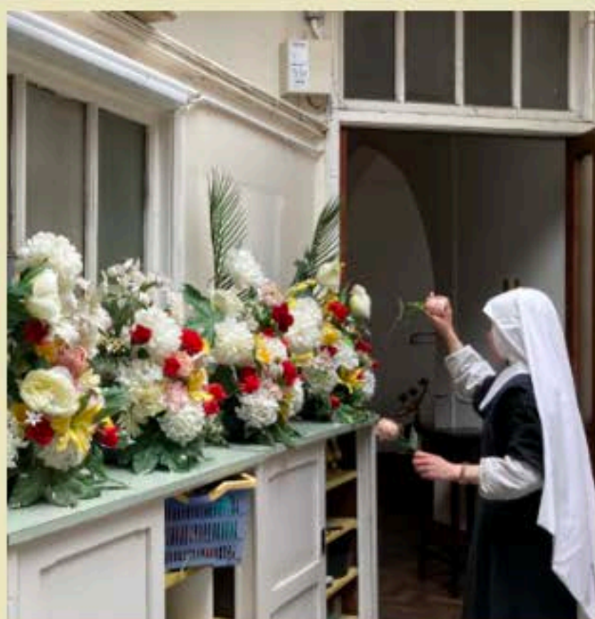
Always the best for Our Divine Lord: preparation of the flowers for Easter

Martyrs, was able to discover the relics which are kept in this beautiful Marian shrine.