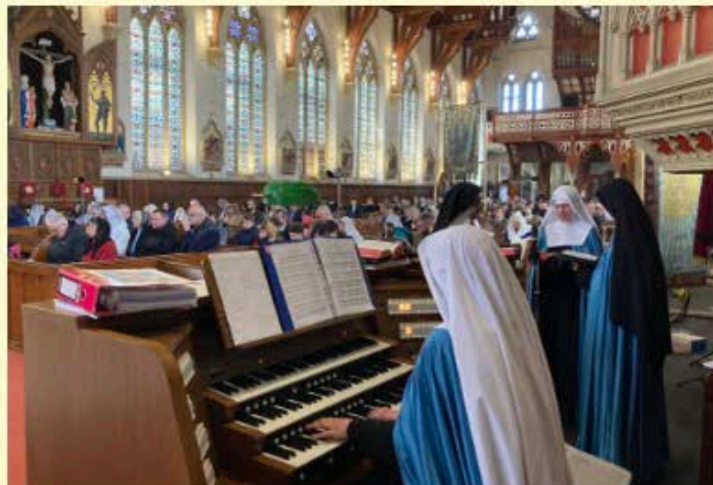
Sung Mass on Easter Sunday at St Walburge's