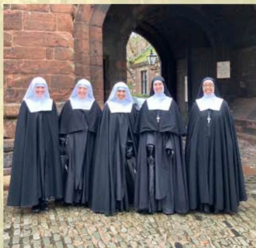
Community outing in Carlisle, near the northern border of England