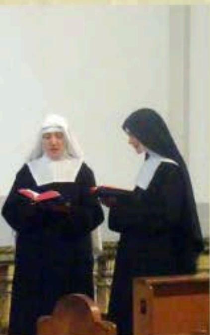
Chant recital at St. Philomena in New Brighton

of Home". We continue our sewing work for the churches: new tabernacle veils for Saint Walburge's church and altar linen (altar cloths or corporals) for the English Martyrs' church.