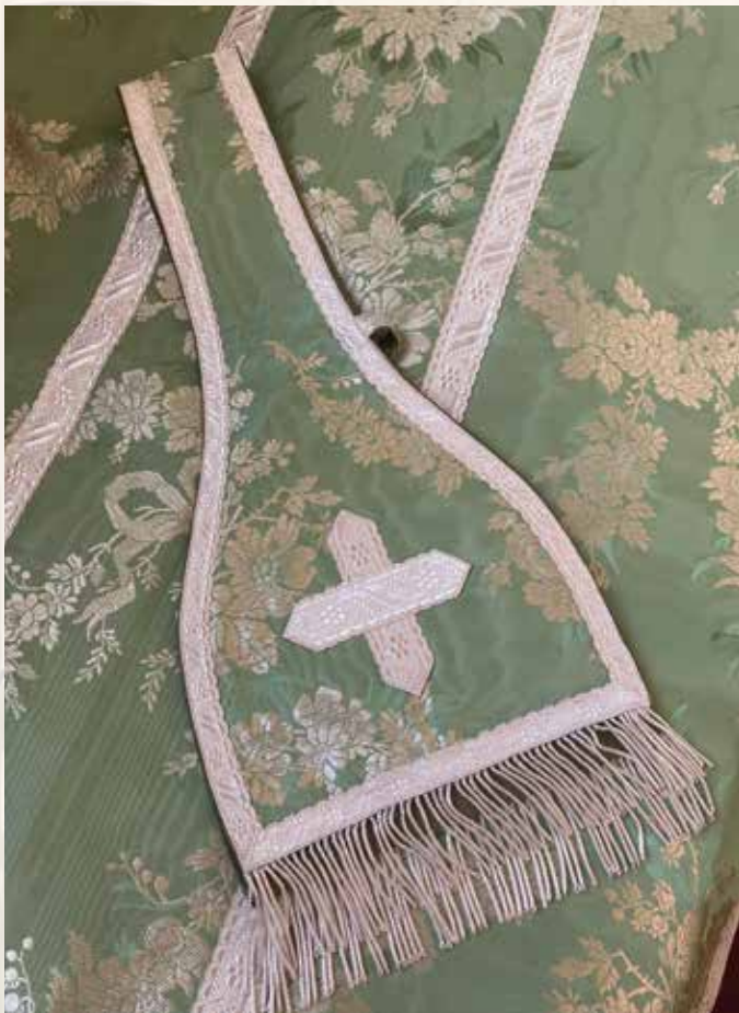
Green Manipule from the brand new High Mass set at the Dome of Home, New Brighton.

One of the vestments used during the Holy Mass is the maniple. It is worn on the left arm of the priest, also by the deacon and subdeacon, at Solemn High Mass, and, of course, by the bishops. Where did the maniple come from ?