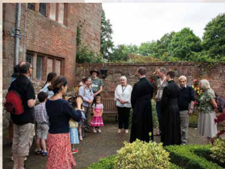
Our Pilgrimage to Harvington Hall: start of the tour of house known for its priests' hiding places