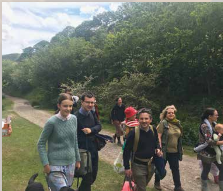
Impromptu outing to the Shropshire Hills for a walk and picnic