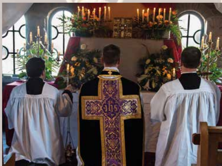
Solemn transfer of the Most Blessed Sacrament on Good Friday