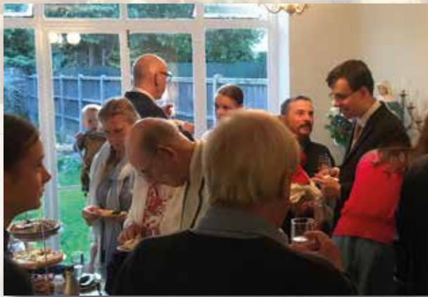
The Faithful at the reception in the presbytery on the occasion of an Open House