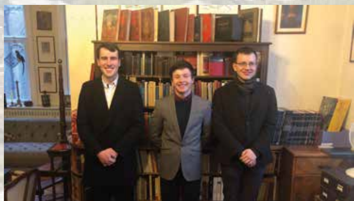
Our House of Discernment continues for its third year