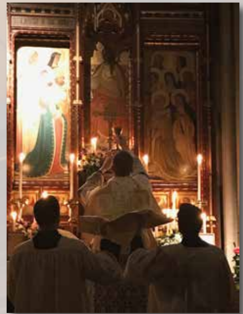
Advent Rorate Mass in Honor of the Blessed Virgin Mary at the Cathedral in Shrewsbury