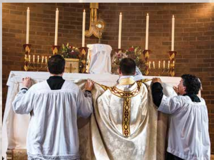
Adoration of the Most Blessed Sacrament on the Feast of Corpus Christi