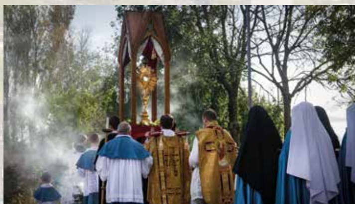
Blessed Sacrament Procession after High Mass on the Feast of Christ the King