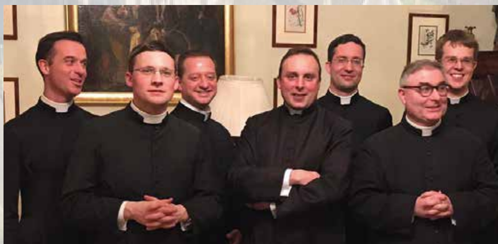
Gathering of the priests of the ICKSP at Preston