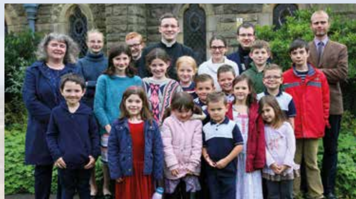
Some of the children and staff of St Benedict's Academy. Open to children aged 5-18. Enquiries: saintbenedicts@icksp.org.uk