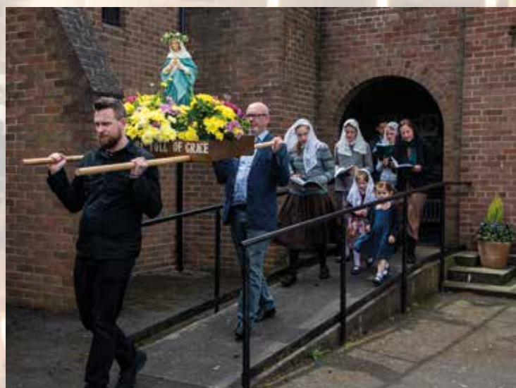
Start of the procession in honor of Mary Queen of Heaven