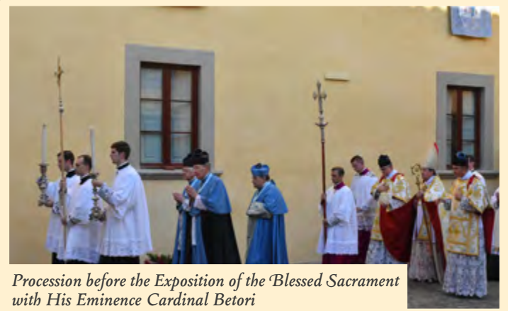
Procession before the Exposition of the Blessed Sacrament with His Eminence Cardinal Betori