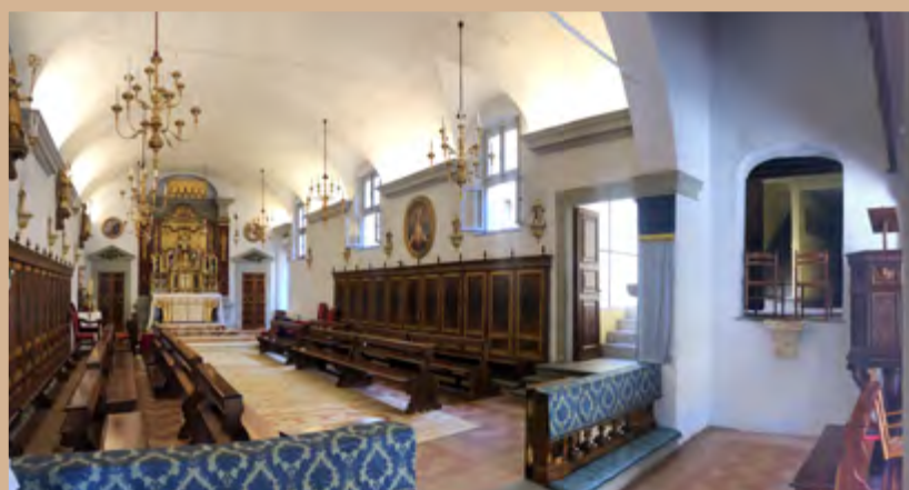
The new chapel entry to the right of the pilaster awaits the staircase's installation

THE COMMUNITY is always growing larger — more than a hundred seminarians this year! Even if a certain number go offsite to study and assist the canons in our apostolates, every year the seminary must accommodate more people.