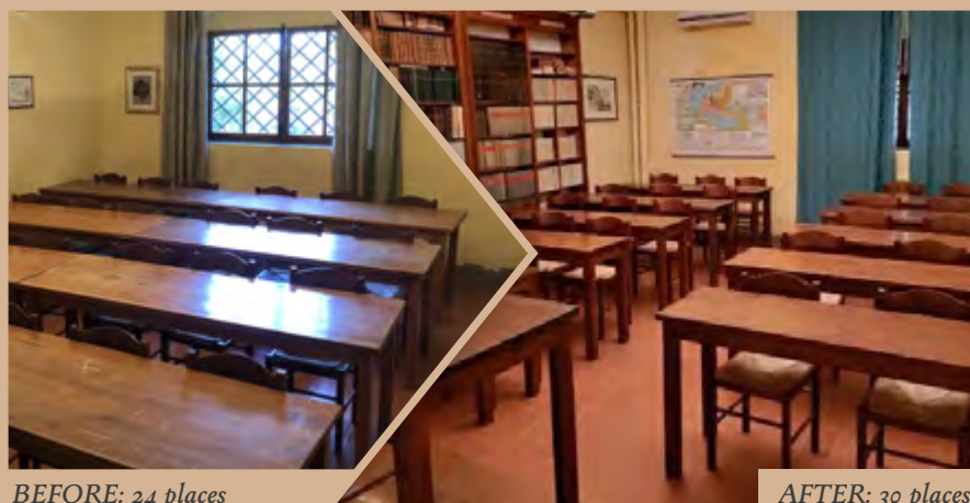
BEFORE: 24 places

But how to make the classrooms larger? To solve the problem, we had to disassemble, saw, narrow and reassemble all the tables in the classrooms. This allowed us to fit more tables, and therefore have more places in a classroom. Everything is now ready for the seminarians!