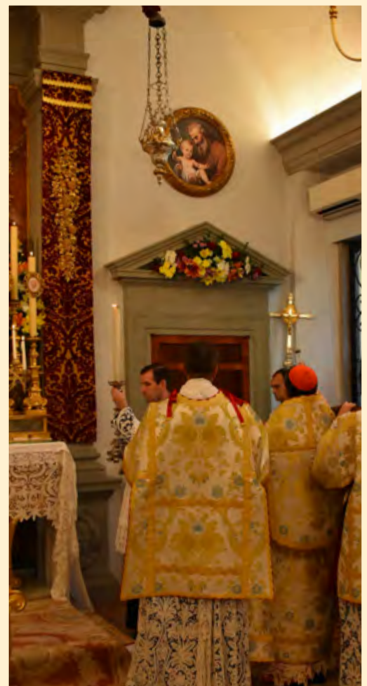
The blessing of the new image of Saint Joseph by His Eminence Cardinal Betori