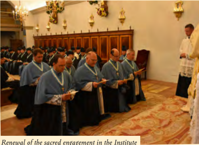
Renewal of the sacred engagement in the Institute