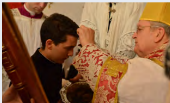
Conferral of the Tonsure on the first-year seminarians