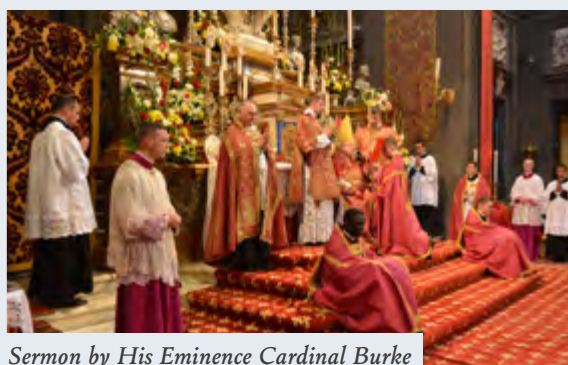
Sermon by His Eminence Cardinal Burke