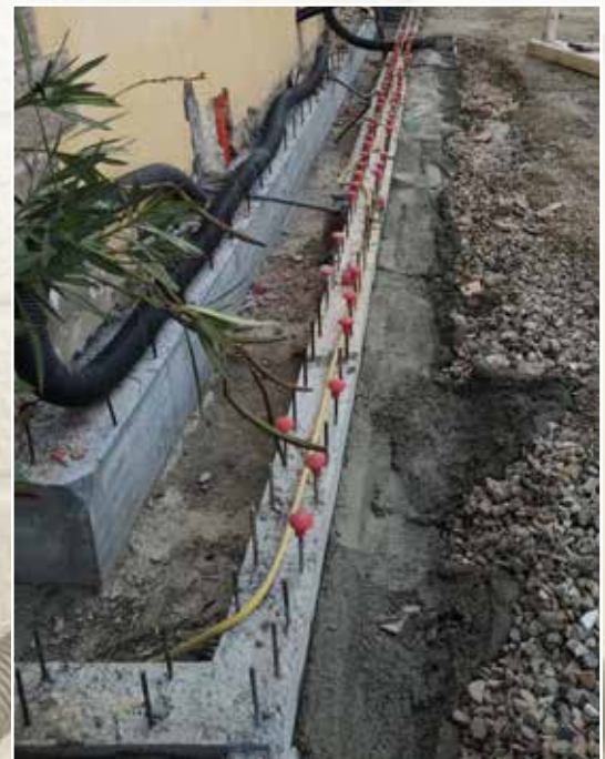
Creation of new foundation to prevent collapse