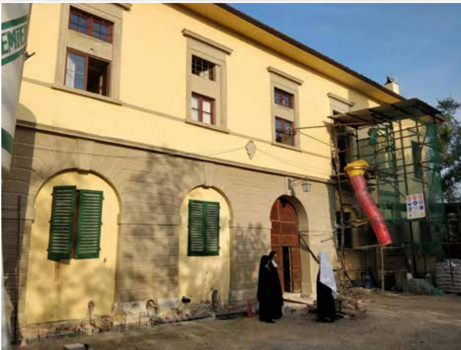
Main entrance façade