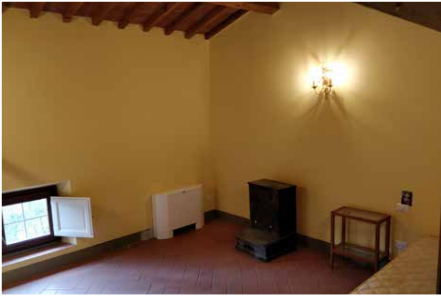
A new room ready to welcome a sister