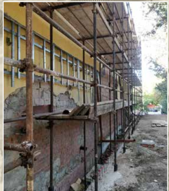
The north façade