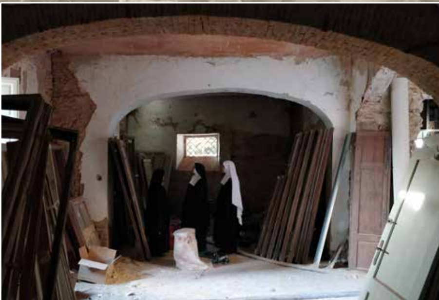
The future refectory of the sisters