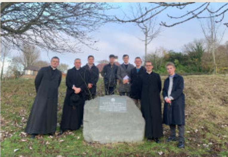
Pilgrims from St. Walburge's House of Discernment visit Lancaster Martyrs Memorial. Holy Martyrs of Lancaster, pray for us!

Let's give thanks to the Lord for all His blessings!